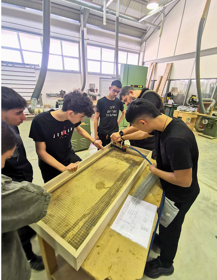
The Secret “Recipe” Is Wood, Fence, Clothes to Make a Sustainable Product