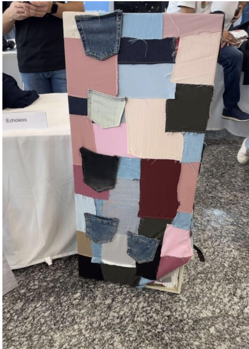
Final Product That Can Be Used Everywhere To Soundproof Any Room From Studios To Plain Home Rooms